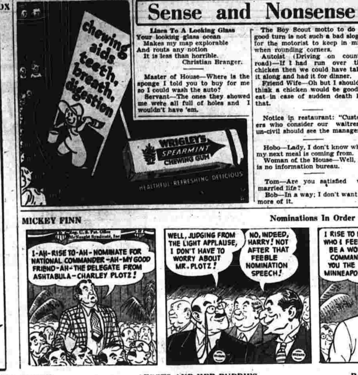
Sense and Nonsense