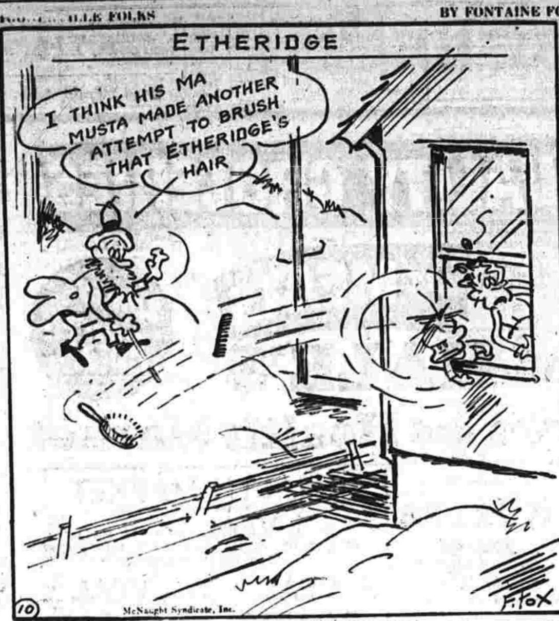
ETHERIDGE BY FONTAINE FOX

Florists—Nurseries CORAGES, 1st cut flowers, 13 dozen, McConville The Florist, 602 Woodbridge street, Tel. 5947.